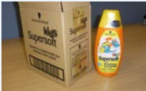
American box solution

In analysing the results the weight given to different impacts is of course subjective and becomes the basis for the discussion with trading partners.